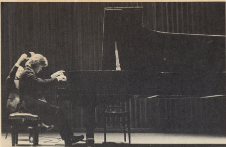
"A very dynamic piece—you must give it what it needs."