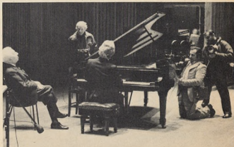
A picture of a relaxed professor, pleased with the results (despite the presence of a TV crew).