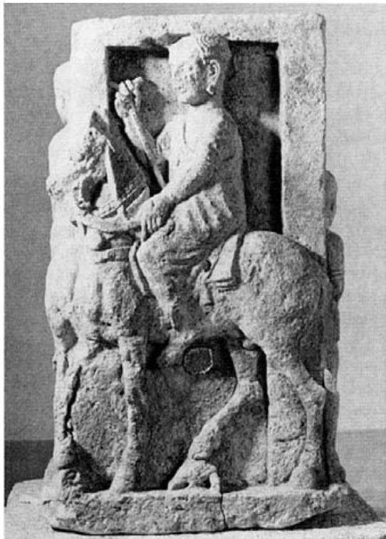
Fig. 1. Funerary monument from Coimbra del Barranco necropolis, first horseman. Jumilla, Provincial Museum.