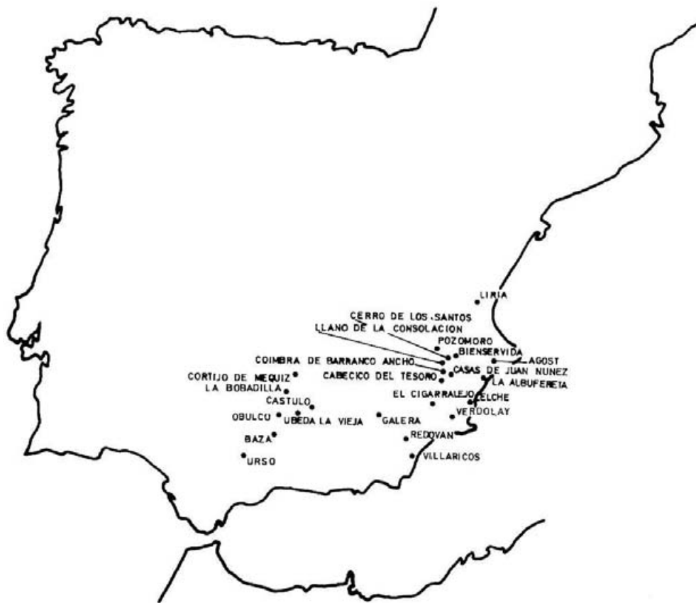
Map of archaeological sites in southeastern Spain

sculpture, Greek influence, or, more specifically, Phokaian influence, has been amply documented from the latter part of the sixth century B.C. on by finds from the area around Jumilla. Langlotz and Blanco have compared the Dama de Elche with sculptures of women from Selinus and Syracuse. A second head from Elche, in a poor state of preservation, resembles a female head of excellent quality in the Berlin Museum that is generally regarded as Phokaian. A female bust from the Iberian sanctuary at Cerro de los Santos may be compared with a Demeter from Klazomenai. The Classical Greek style of the sculptures from Aegina and Olympia may be seen in a head datable ca. 450 B.C. from Verdolay (Murcia), 49 not far from Jumilla. The head of the Kore of Alicante 50 is comparable to the late Archaic Ionic style of the korai of Athens. The sphinx from Agost (Alicante) 51 docu-