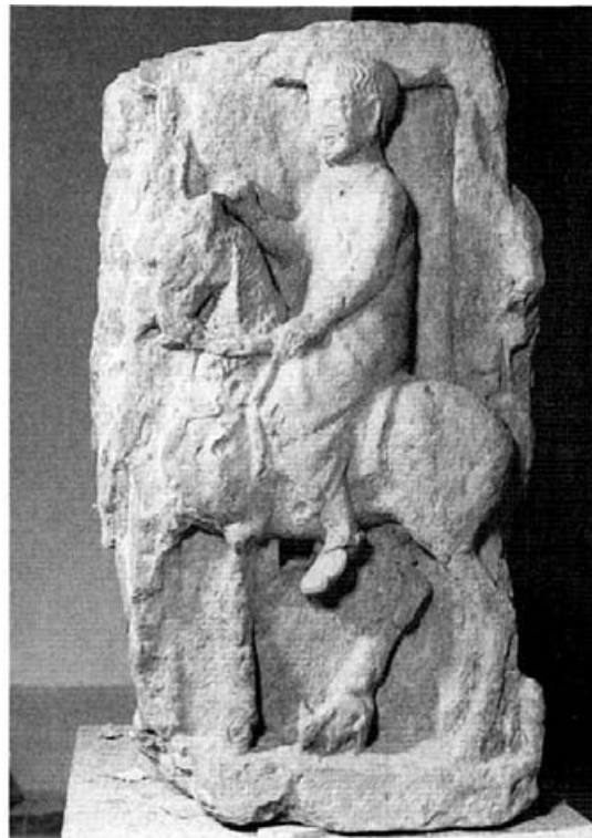
Fig. 2. Funerary monument of Jumilla, second horseman.

Cigarralejo of the fourth century B.C. 9 The mane of the horse of the first Jumilla rider falls to one side of the neck, as on one of the horses from El Cigarralejo. Such a long mane is not typical of Iberian horses; it is not seen, e.g., on the Juan Núñez horse or the horse's head found in a tomb at Cástulo (Jaén) of the fifth century B.C. 10 It is, however, characteristic of some of the horses found at El Cigarralejo. A leather strap across the horse's chest secures the saddle. There are two other straps across the neck. The lower one is decorated with a disk toward the front, possibly having to do with the phalera . The upper strap is decorated with a row of circles in relief which are probably metallic. All of these details and the form of the head relate this horse and the other two Jumilla horses to the head of one of the El Cigarralejo horses and set them apart