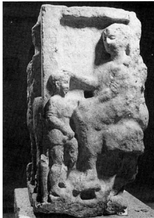
Fig. 4. Funerary monument of Jumilla, seated woman and youth

the first in the absence of a baton; the man's clenched fist rests instead on the head of the horse. The right front hoof is broken off and the left side of the relief is generally poorly preserved. The right hind hoof rests on a rabbit, an animal common in the Iberian peninsula in antiquity (Strab. 3.2.6; 3.5.2).